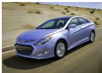
2) Hyundai Sonata Hybrid