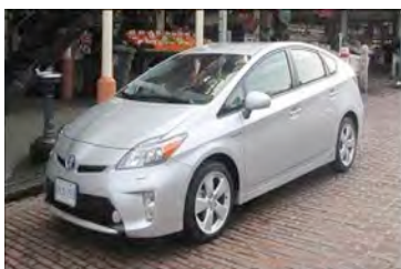
1) Toyota Prius Liftback