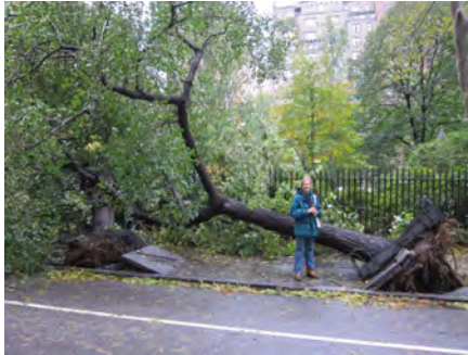
Trees felled by Sandy near EV’s offices

The new RNG production industry is raring to grow. With your continued support in 2013, EV is poised to move RNG forward – through education and outreach – in the Empire State and beyond.