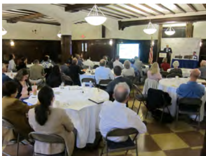
Workshop attendees filled Pace Law School’s Tudor Room to hear from industry experts.

Energy Vision and Pace Energy and Climate Center co-sponsored the first event in New York State on “Turning Local Organics into Vehicle Fuel.” As this technology is a prime environmental and economic opportunity for New York State communities, it was fitting that the workshop was held at Pace Law School in White Plains, New York. Pace Law School’s Environmental Program is consistently ranked among the best in the nation and the workshop reached an engaged audience – more than 50 people from industry, state government, and academia.