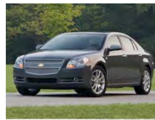
3) GM Chevrolet Malibu Hybrid