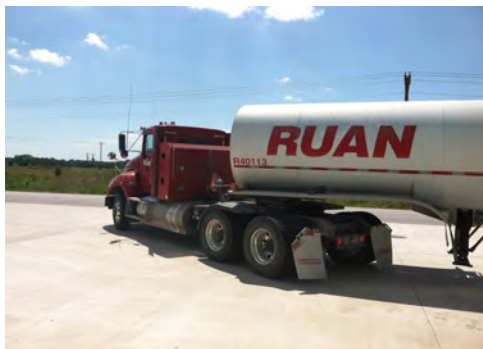
At Fair Oaks Dairy in Indiana, RNG made from liquid manure powers 42 long haul trucks that carry milk to customers in Kentucky, Michigan and Tennessee.

Fossil natural gas is one commercial option. It is a domestic resource, is 80% cleaner than diesel, and is 20%-25% lower in greenhouse gases. However, there is heated debate about the environmental and health impacts of the drilling technique known as horizontal hydraulic fracturing (or “fracking”) used to extract most of this gas. RNG, produced from waste, involves no drilling.