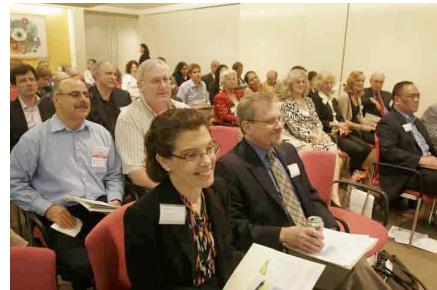
Energy Vision’s May seminar in New York City on hydrofracking, hosted by Linklaters, LLP.

Regarding use of natural gas to power this country’s heavy duty vehicles, our outreach has emphasized that use of the cleanest and most abundant fuel option this country has does not rely on expanded hydrofracking . The shift from diesel to natural gas by every urban bus and truck fleet in the US would take just a fraction of this country’s already developed natural gas supplies. No new drilling is needed .